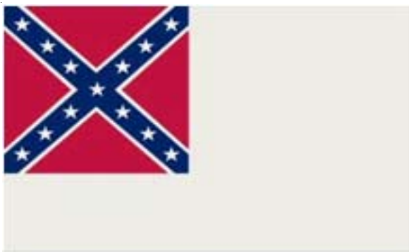
2nd National - "Stainless Banner"

It was to be 1/4 of the area of the flag beyond the now rectangular canton. The width was to be 2/3 of length. The canton was to be 3/5 of width and 1/3 of length. This was signed into law on March 4, 1865; very few if any of the Third National pattern flags saw service during the war, since General Lee's Army of Northern Virginia surrendered just a few weeks later at Appomattox.