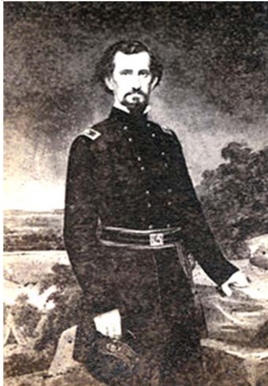
Felix Kirk Zollicoffer (May 19, 1812 – January 19, 1862)

BG Micah Jenkins Camp # 1569 4240 Mt Gallant Road Rock Hill, South Carolina 29732