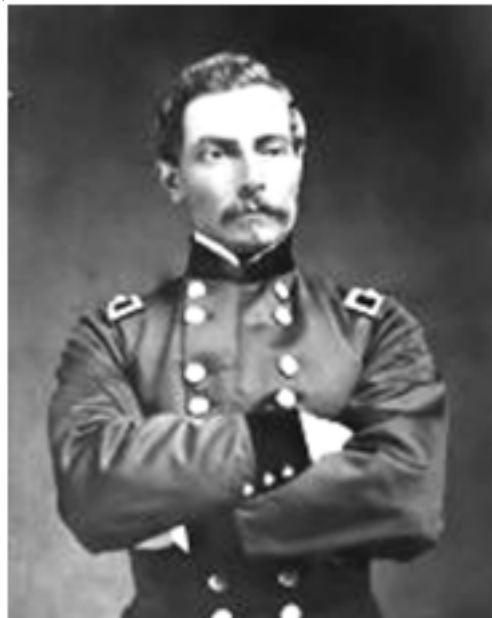
P.G.T. Beauregard (May 28, 1818 – February 20, 1893)

BG Micah Jenkins Camp # 1569 4240 Mt Gallant Road Rock Hill, South Carolina 29732