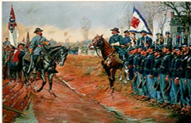
The Last Salute at Appomattox