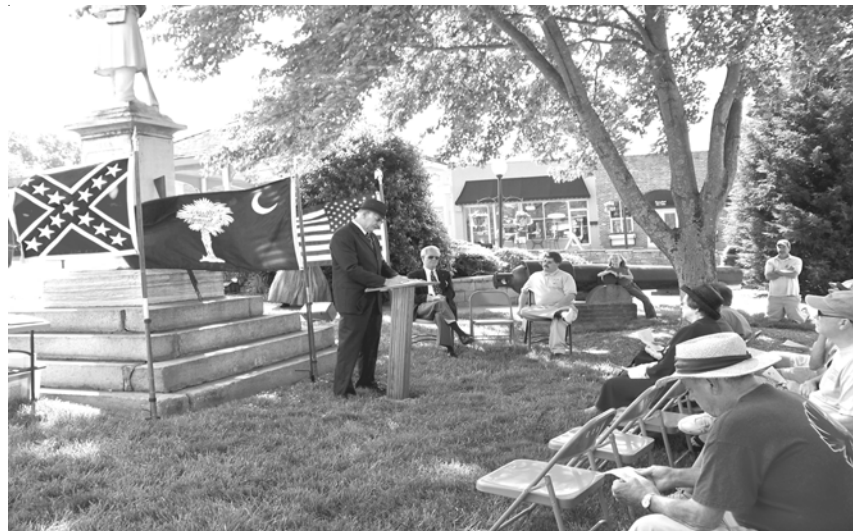
Confederate Memorial Day May 9 th 2009 Fort Mill, South Carolina