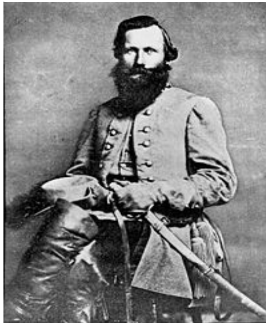
James Ewell Brown (J E B) Stuart February 6, 1833(1833-02-06) – May 12, 1864 (aged 31)

BG Micah Jenkins Camp # 1569 4240 Mt Gallant Road Rock Hill, South Carolina 29732